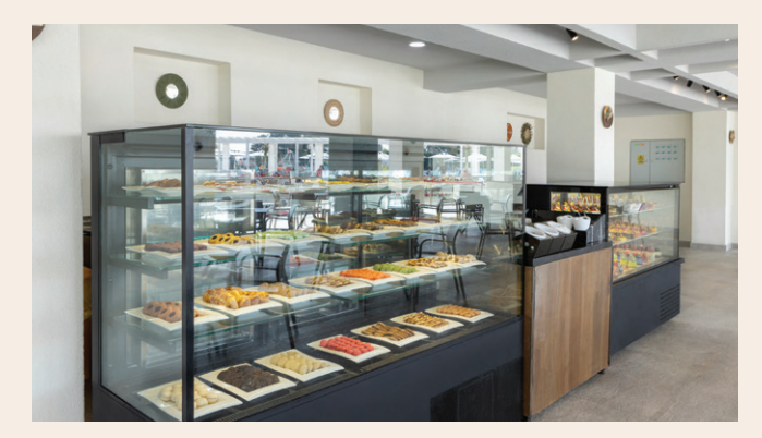
Aqua Snack Passion Cocktail Bar Patisserie