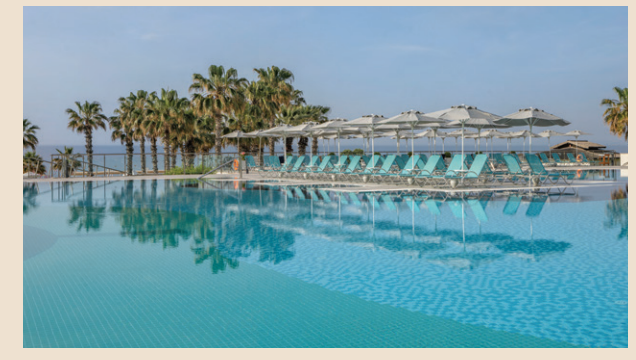
Aqua Park Pool Indoor Pool Main Pool