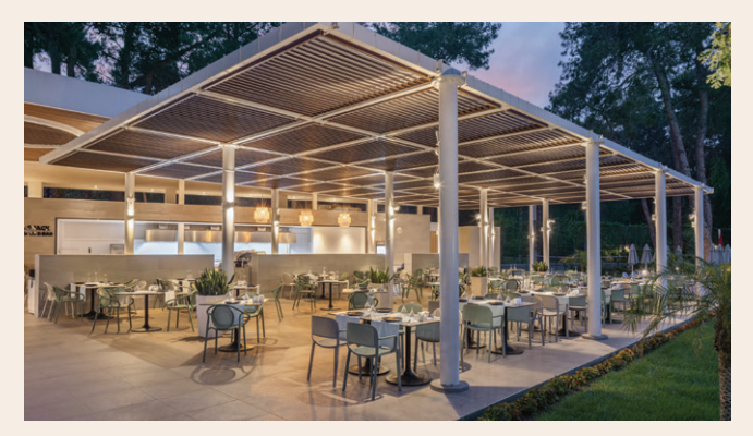
Mexican A La Carte Turkish A La Carte Far East A La Carte